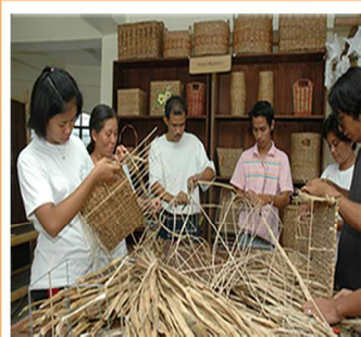
Water Hyacinth Weaving Enterprise