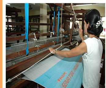
Handloom Blanket Weaving