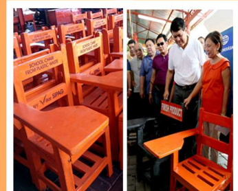
Recycling of Waste Plastic into School Chairs