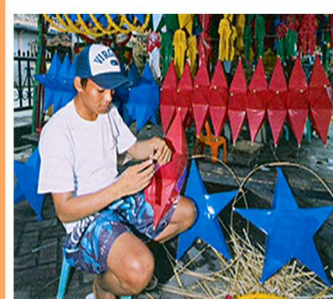
Parol Making out of Bamboo