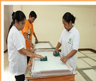
Handmade Paper out of Waterlily and Waste Paper