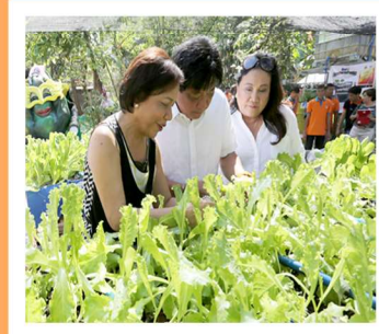
Villar SIPAG Farm School