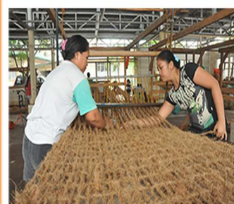
Coconut Weaving out of Waste Coconut Husks