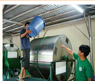
Kitchen & Garden Waste Composting Organic Fertilizer