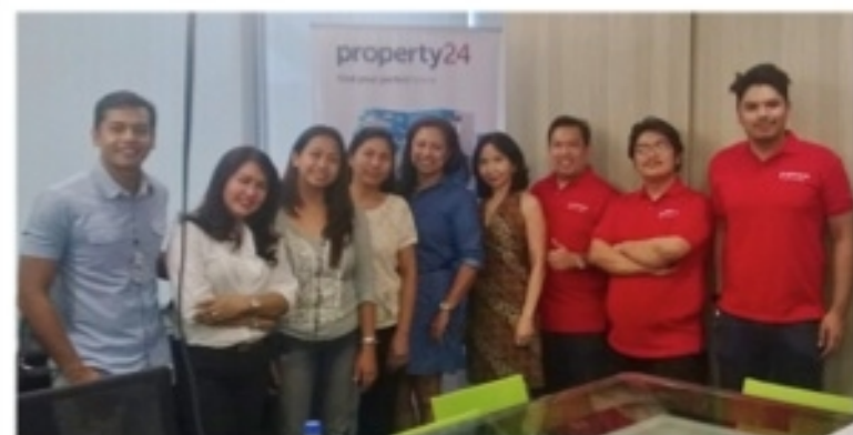
PLAREB attendees at PROPERTY24's Seminar on Photography, Copy Writing and Photo Editing for use on Websites on May 20, 2014.

MLX Tuesday's was also visited by PNC Garnet Property Holdings Corp. and DMCI HOMES who took time to introduce their latest projects. PNC Garnet has residential single detached and townhouse project in Topman Village inside BF Homes. The developer decided to build right outside "The Village Sports Club" which they have developed and own. DMCI Homes just recently launched its Resort-like Community in San Antonio Valley 2 called ASTERIA RESIDENCES .