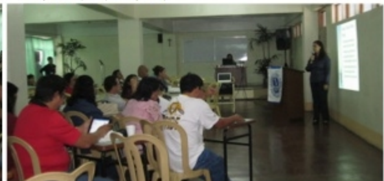
CPD Seminars held at the St. Rita Orphanage in Sucat, Paranaque City. Three batches were conducted: February, May and July of with about 100 attendees each.